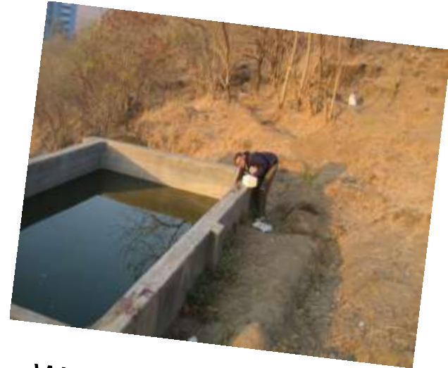
Water Tanks on Hanuman tekdi.