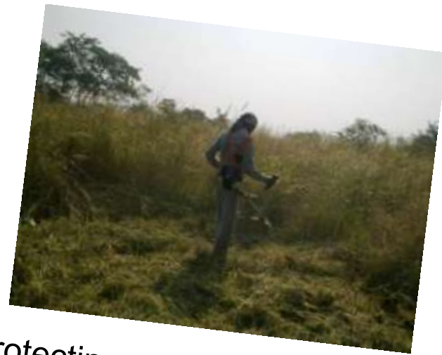
Protecting plants from accidental hefire by cutting 5 ft grass after each monsoon