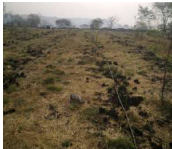
Plants getting water using drip irrigation