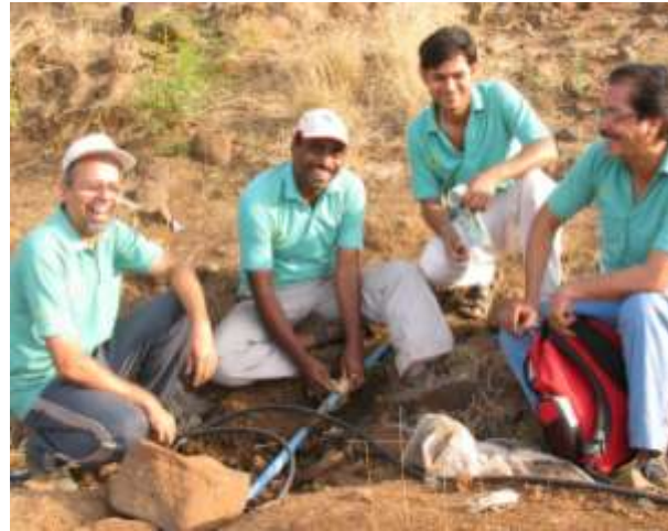
Volunteering is stress relieving