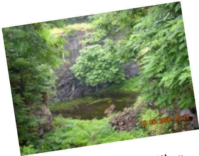
Natural stone query getting filled by rain water harvesting at Hanuman Tekdi