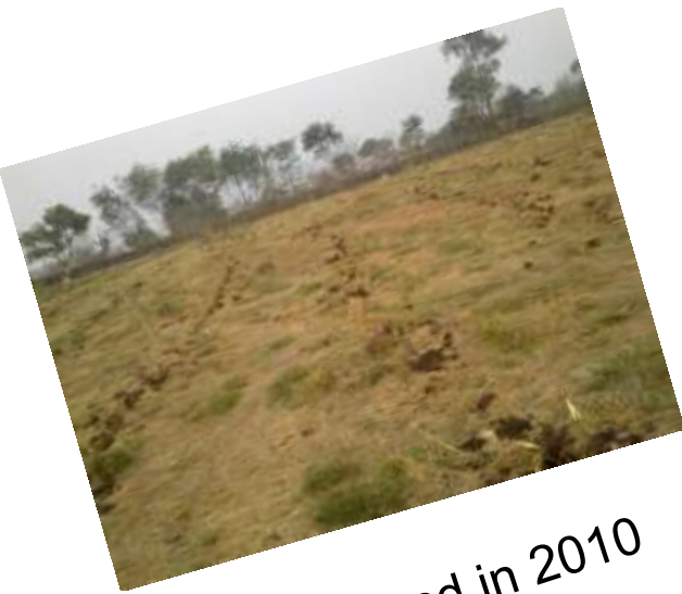
Barren land in 2010