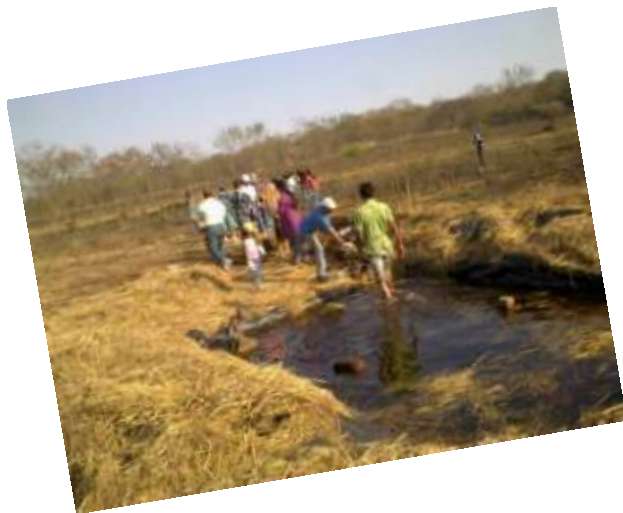
Artificial pond for Peacock and birds