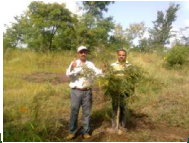
Long struggle .