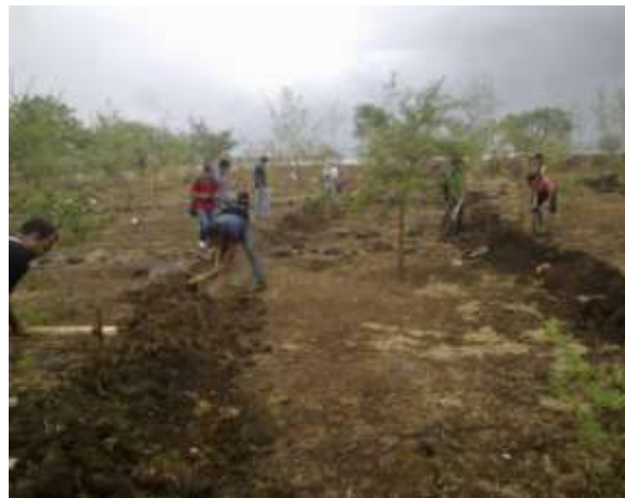
It is not so taxing 😊