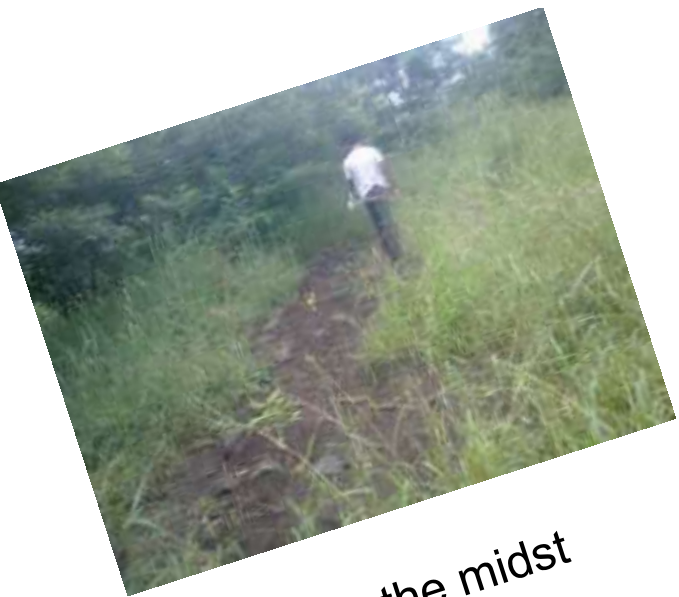
Seeds in the midst of Glyricidia