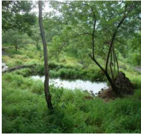
Small Ponds - rainwater harvesting on Hanuman tekdi.