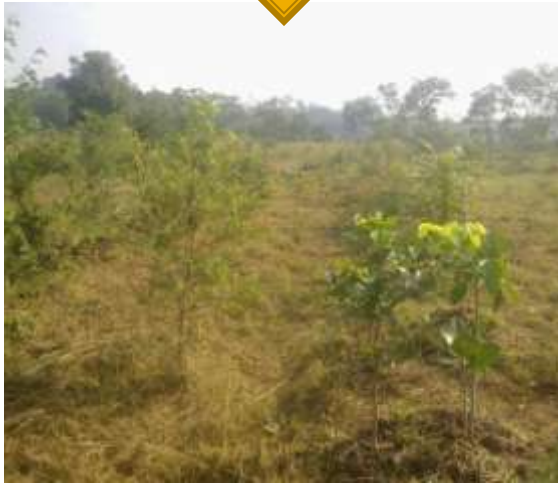
Hanuman Tekdi (From 1998..... )