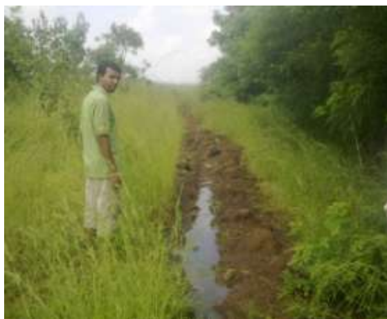
Will they make it ?