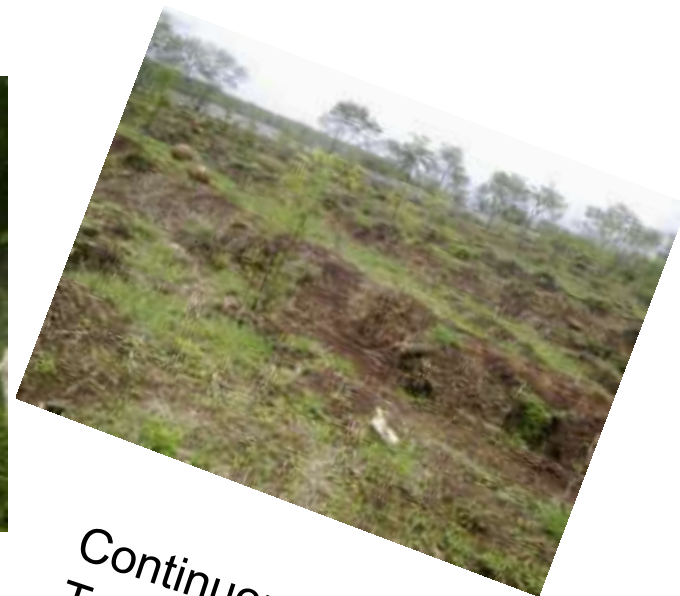
Continuous Contour Trenches