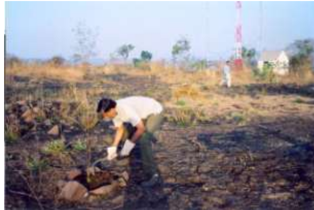
Daily soil work