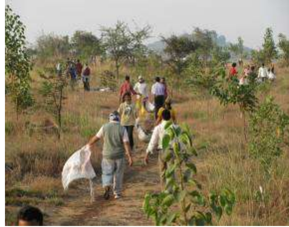
Ten ton of Household wet waste distributed to all trees