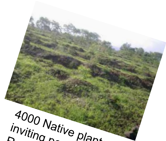
4000 Native plants inviting peacock's , Rabbits , snakes and deer