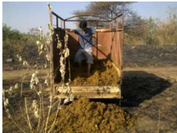
Improve quality of soil by Putting bio fertilizer.