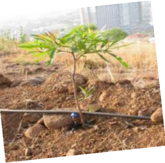
2000 plants are being Watered using drip Irrigation.