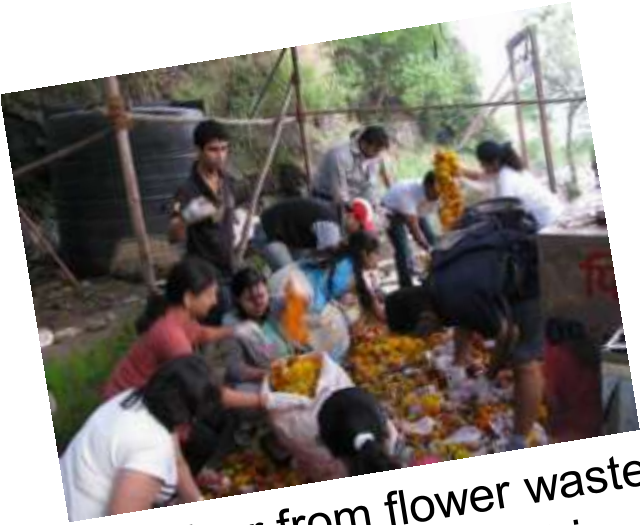
Bio-fertilizer from flower waste “Nirmalya” during navaratri