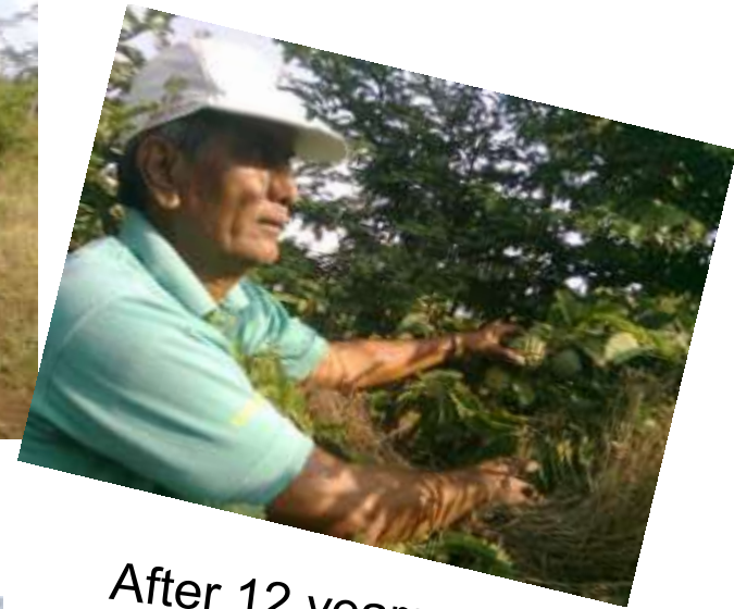
After 12 years of struggle ...