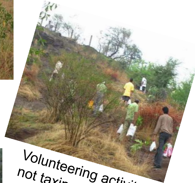
Volunteering activity is not taxing.