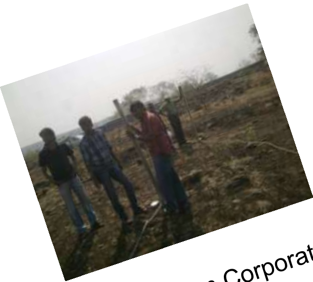
Contribution from Corporate employees and students