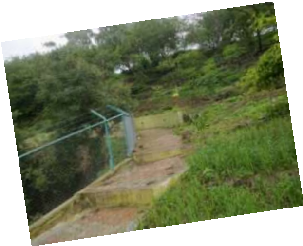
Hanuman Tekdi- No need of health club.